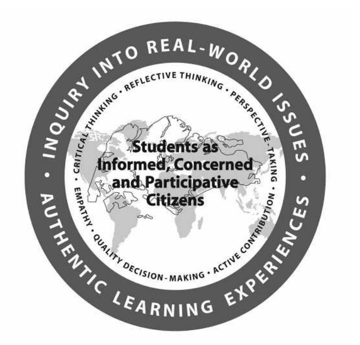
Figure 1.1 The Singapore Social Studies Curriculum